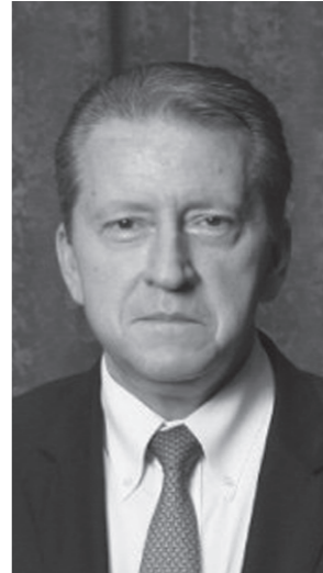
Russian ambassador Nikolay Kudashev

NEW DELHI, JULY 14 /- / The sky is the limit for expansion of the Russia-India strategic partnership, Russian ambassador Nikolay Kudashev said today with the two countries ramping up preparation for an annual summit as well as the first '2+2' ministerial meeting.