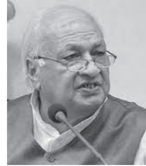
Governor Arif Mohammed Khan

and Union Minister, V Muralidharan, said in a Facebook post. Hailing Khan for taking up such a cause, he said it may be a "rare episode" in the administrative history of the country. He also said it is for the state government to find out why the Governor, the head of the state, has to fast seeking the safety of women. Kerala Pradesh Congress Committee President K Sudhakaran claimed that the failure of the state government to ensure safety and security of people was one of the reasons why the Governor was sitting on a fast.