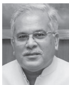
Chhattisgarh Chief Minister Bhupesh Baghel

would not have increased so much, said the chief minister. Baghel was responding to a question on Uttar Pradesh's draft population control bill and a proposed formulation of a policy in this regard in Assam-- both states are ruled by the BJP.