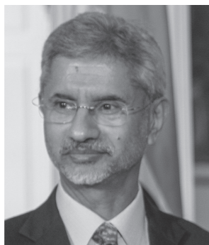
External Affairs Minister S Jaishankar

NEW DELHI, JULY 14 /- / Emphasising that the future of Afghanistan cannot be its past, India today presented a three-point roadmap for the conflict-ridden country that entailed cessation of violence and terrorist attacks, settlement of the conflict through political dialogue and steps to ensure that neighbouring countries are not threatened by terrorism, separatism and extremism.